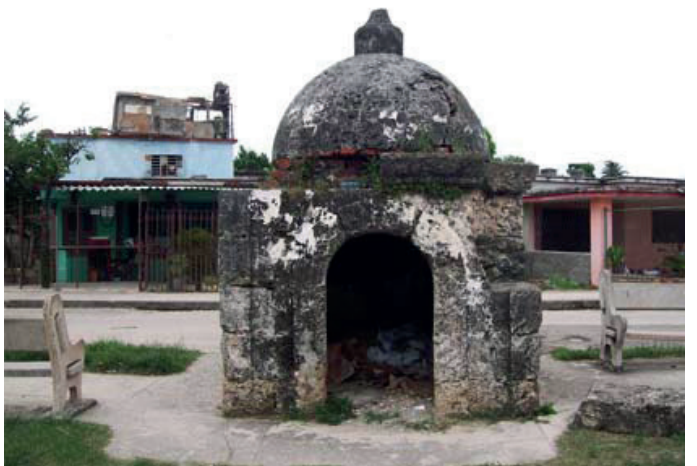
Fig. 5. One of the small towers that protected the ventilators of Fernando VII aqueduct in Independence street.