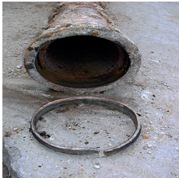
Fig. 2. In Philadelphia the joints of the pipes were filled with lead, technique that was also used in Havana.