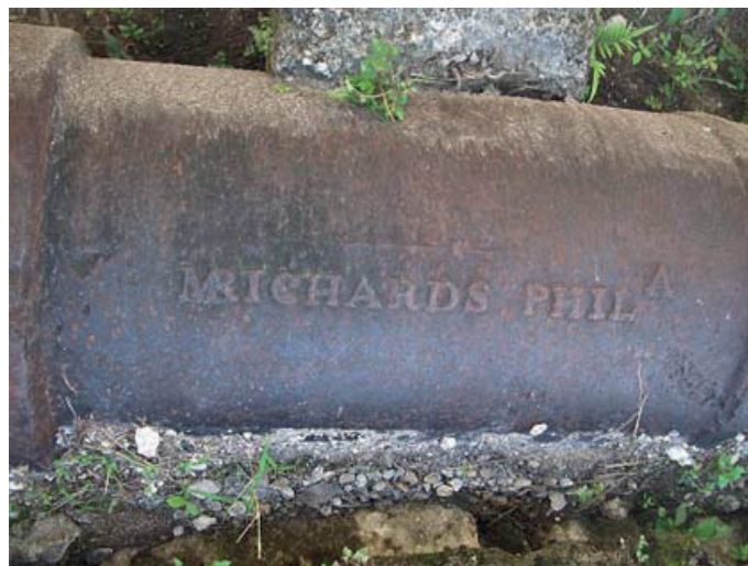
Fig. 3. One of the iron pipes cast in Philadelphia still in use, with the abbreviations of the name of the contractor and the city.

In 1860 the city had 3399 privates plumas and 575 public ones. (18) Those days the city received something around 9 000 cubic meters of water every day.