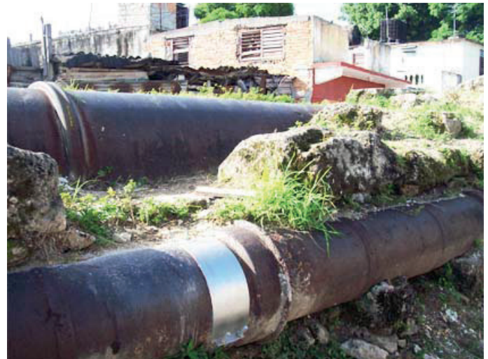
Fig. 4. Top to bottom: the iron pipes of Albear (1893) and Fernando VII (1835) showing a repair. The pipes are on top of a wall built to protect them in the street named Resguardo (protection) in Cerro municipality.