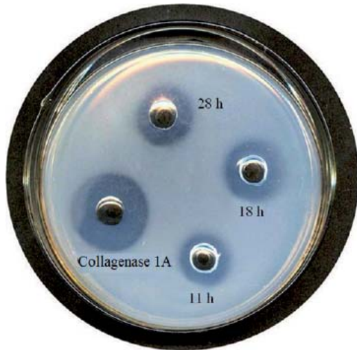
Figure 2. Proteases produced by Tsukamurella paurometabola C-924 on agarose gelatin at different times. Collagenase 1A was used as a positive control.

seeds sowing under greenhouse conditions. Figure 3A shows a statistically significant increase in shoot elongation in plants inoculated with T. paurometabola C-924 or Pse. fluorescens C 16. Both strains signifi-