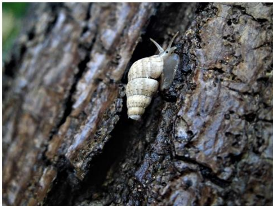
Figure 2. - Illustrative image of the external morphology of P. neglectus during diurnal activity on the trunk of Swietenia mahagoni favored by rainfall at the locality

The height above the ground showed a mean value of 153.5 \pm 71.3 cm and a maximum of 394 cm. During rainy days, the frequency of P. neglectus mollusks on the trunk increased. A greater number of active individuals was also observed on this substrate (Figure 2).