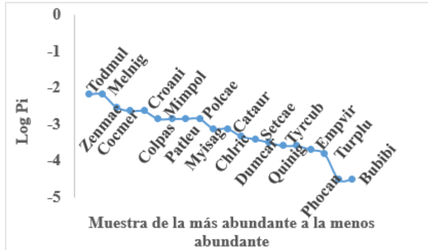
Figure 2- Whittaker curve or abundance range for the sites studied

Regarding the relative abundance of the species, the values obtained differ in each of them, Todus multicolor is the most abundant followed by M. nigra despite the fact that the latter is one of the most hunted species in the country. Similar results were obtained by Gómez (2019) in a study of bird communities in submontane rainforests in Alejandro de Humbolt National Park (Figure 2).