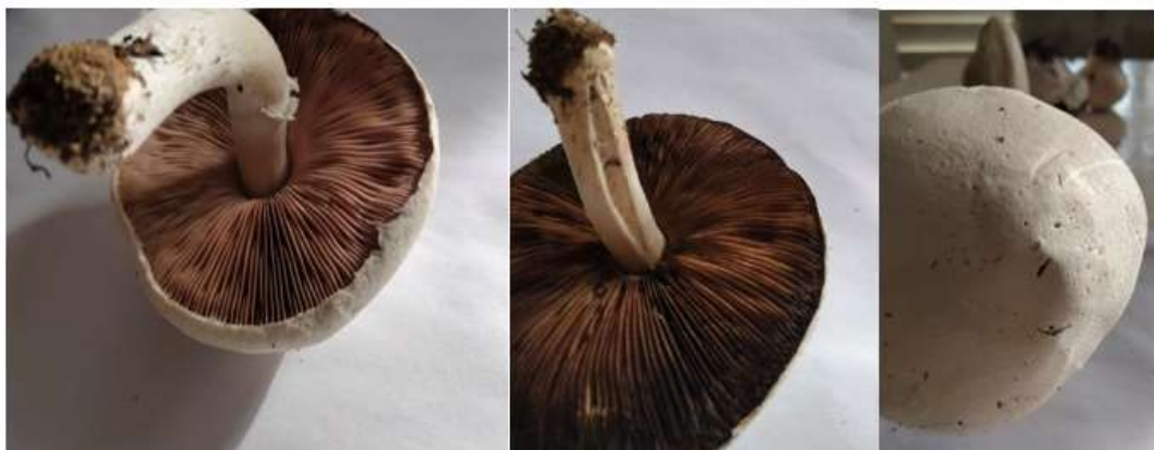
Figure 2. - Images of the fruiting body of Agaricus campestris (L.)

Álvarez et al 2021 found species of the genus Agaricus associated with the families Achatocarpaceae, Boraginaceae, Fabaceae, Nyctaginaceae and Polygonaceae presented during the dry and rainy seasons in Mexico. In addition, this genus is an obligate symbiont, so the absence of mycorrhizae affects the survival and development of the plants to which they are associated (Salcido et al. , 2020).