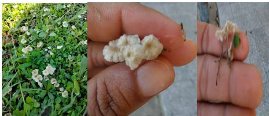
Figure 6. - Images of the fruiting body of Tetrapyrgos nigripes (Fr.) E. Horak

Jagadish et al. , (2019) found several species of ectomycorrhizal fungi associated with Anacardium occidentale , among which we can mention the species Tetrapyrgos nigripes , Agaricus sp. These species carry out a mycorrhizal symbiosis with the plant, helping it with nutrition by providing phosphorus and nitrogen. The ectomycorrhizae can be used as quality indicators for forest plants in nursery conditions since they help in their nutrition (Montoya, 2016).