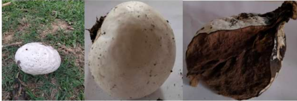
Figure 1. - Images of the fruiting body of Calvatia gigantea (Batsch) Lloyd

This fungus presents a large fruit set that can measure up to 65 cm, globe-shaped and white in its youth, which presents a Saprophytic way of life for this species (Barroetaveña et al. , 2020). This species can be found solitary or in small groups on the ground (Verma et al. , 2018).