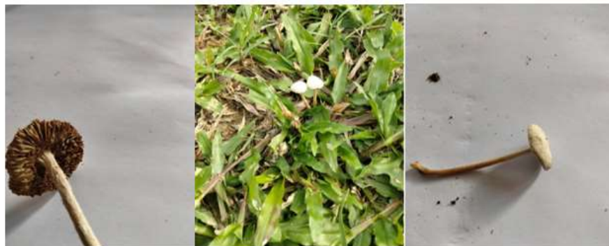
Figure 4. - Images of the fruiting body of Agrocybe Sp.