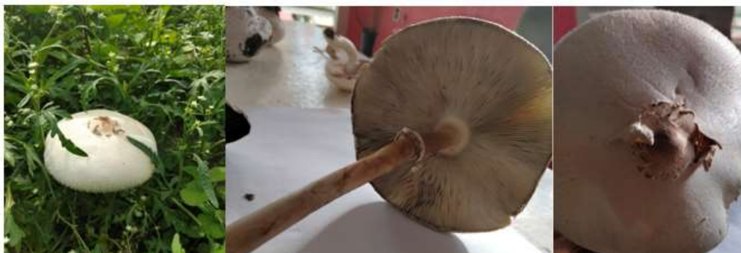
Figure 3. - Images of the fruiting body of Chlorophyllum molybdites (G. Mey.) Masee

The species Chlorophyllum molybdites (G. Mey.) Masee presents a crown 100-180mm; little meat, especially on the edge, firm; initially spherical to oval, then hemispherical, and finally extended, tending to undulate or deform, somewhat depressed, sometimes with a slight obtuse ridge on the disc. In addition, this species has a ring and its mode of nutrition is Saprophytic (Becerra and Mateo 2018).