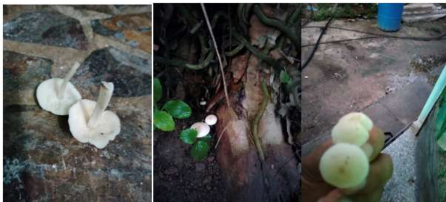
Figure 5. - Images of the fruiting body of Lactocollybia Sp.

The species of ectomycorrhizae belonging to the agarical order are related to angiosperm plants distributed in the tropical deciduous forest, which coincides with this specimen, which was found in association with Psidium guajava trees in tropical areas (Álvarez et al. , 2021).