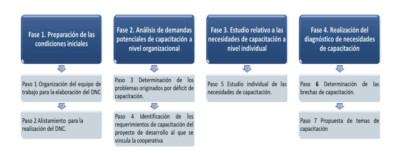
Fig. 1 - Structure of the methodological guide for DNC in agro-livestock cooperatives linked to development projects

Salgado Rodríguez, A.; Tamayo Rosabal, T.; Loredo Carballo, N; Quiroga Gómez, Z. M.; Morell Morfa, R. "Training needs diagnosis in agro-livestock cooperatives linked to development projects" p. 350-378 Available at: https://coodes.upr.edu.cu/index.php/coodes/article/view/336