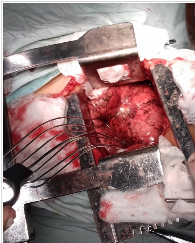
Fig. 4. Optimal state of muscle relaxation, padded ribs and placement of two rib spreaders, allow for a wide operating field to access practically any intrathoracic structure.

lary line since the incision is performed in the posterior line, taking the anterior border of the broad dorsal muscle as an anatomical reference. It should be remembered that the incision in the posterior axillary line offers considerable aesthetic advantages when compared to those located in more anterior regions 3 .