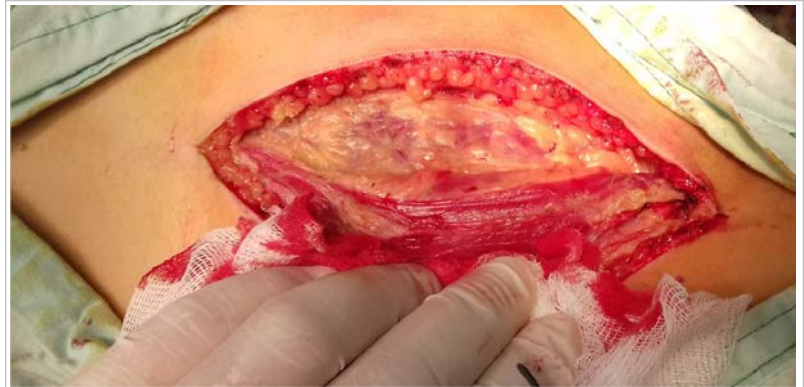
Fig. 2. The anterior border of the broad dorsal muscle is used as an anatomical mark for both skin incision and intercostal space approach.

When surgery has been completed, the thoracic cavity is routinely closed but without the use of a rib contractor to knot the pericostal stitches, since the integrity of the muscular layers, which was practically not modified, greatly facilitates the closure of the intercostal space. This technique does not require submuscular drains at all since the large-flap surgery described in the classical approaches was unnecessary.