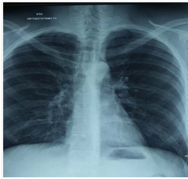
Figure 2. Plain chest X-ray, posteroanterior view.