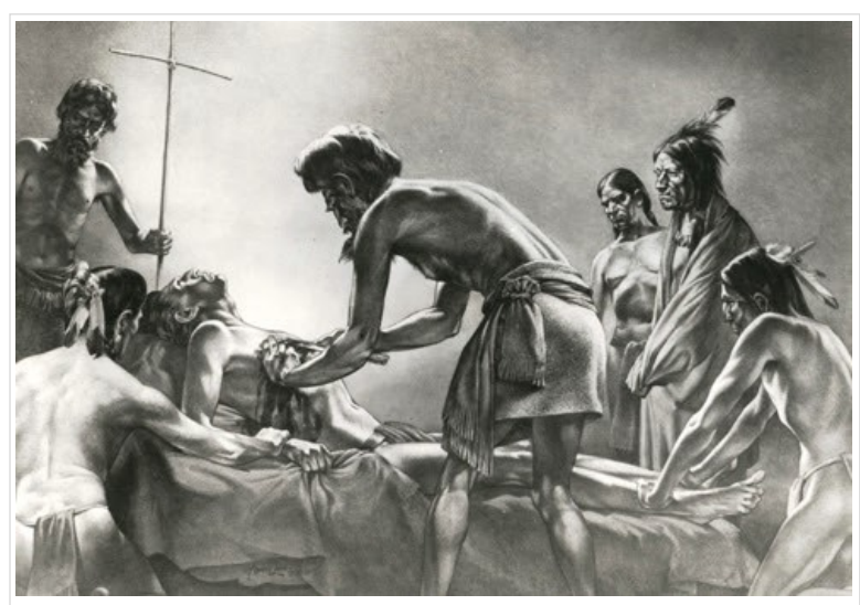
Figure 4. Staging of the supposed first surgery in the vicinity of the heart, performed by Alvar Núñez Cabeza de Vaca. Taken from: Internet Classroom - The First Recorded Surgical Operation in North America was performed by Cabeza de Vaca in 1535 when he took an arrowhead out of the chest of an Indian

(https://www.angelfire.com/zine/excel/spexplorers.html).