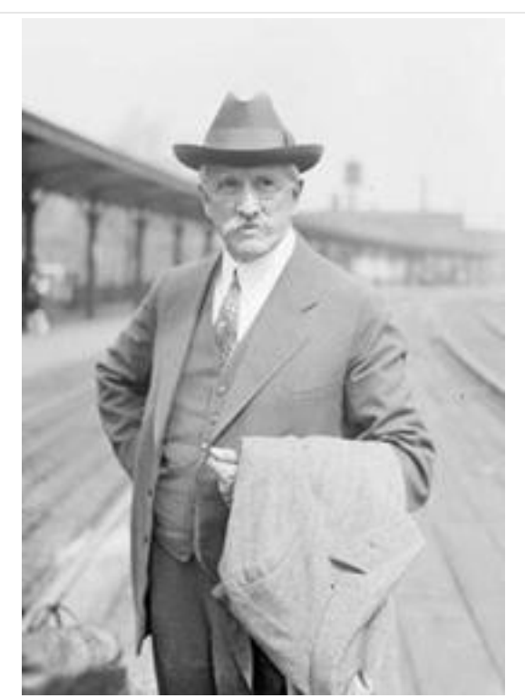
Figure 1 . James Henry Breasted (August 27, 1865 - December 2, 1935).

Once the practice of thoracic surgery in ancient Egypt has been ruled out, at least in the pages of the Edwin Smith Papyrus, Hippocrates ( Figure 2 ) is presumed to have been the first thoracic surgeon in history. He is credited with the first recorded open evacuation of an empyema by placing small metal cannulas as drains for several days. It is difficult to determine the exact period of the procedure. Approximate dates such as 500 and 229 B.C.E. <sup>19,20</sup> have been considered, but they do not coincide with the period of the Father of Western Medicine, who also in the search for better therapeutic alternatives for