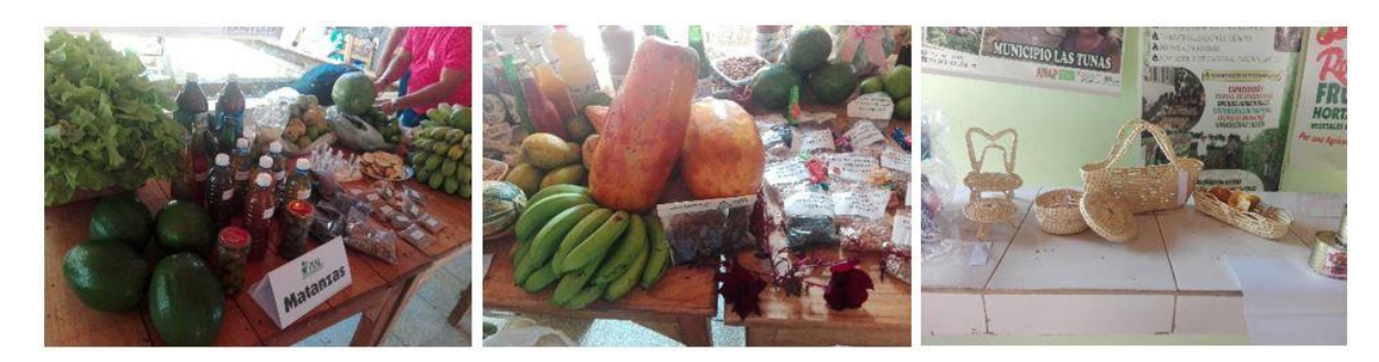
Figure 2. Women and men participate in PIAL innovation festival, 2019

The increase in productive initiatives developed by women, including: making and marketing of floral arrangements, wines and vinegars, handicrafts, textiles, ornamental plants, farm and yard animals, goat milk (distributed in wineries), oilseeds (oil and cakes), use of energy with bio-digesters, fruit trees and grains, are the result of the training received by women and men. Women systematically exhibit handicrafts, crafts, flowers, culinary, agrobiodiversity fairs, and they are marketed with the population participation and income is received from sales (Figura 2).