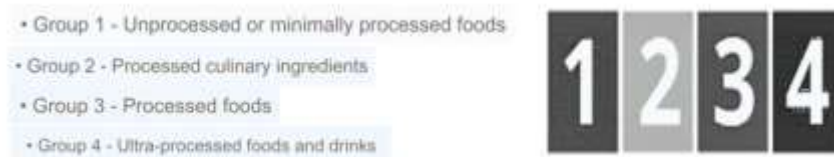
Fig. 1. - NOVA food classification

There are many organizations, including the WHO, FAO, etc., that have warned of the problematic nature of Group IV foods because of their poor nutritional quality being energy-dense and containing very high amounts of critical nutrients. If consumed regularly, they can lead to the development of chronic non-communicable diseases, such as obesity, hypertension and type 2 diabetes. (FAO, 2019) (Figure 1).