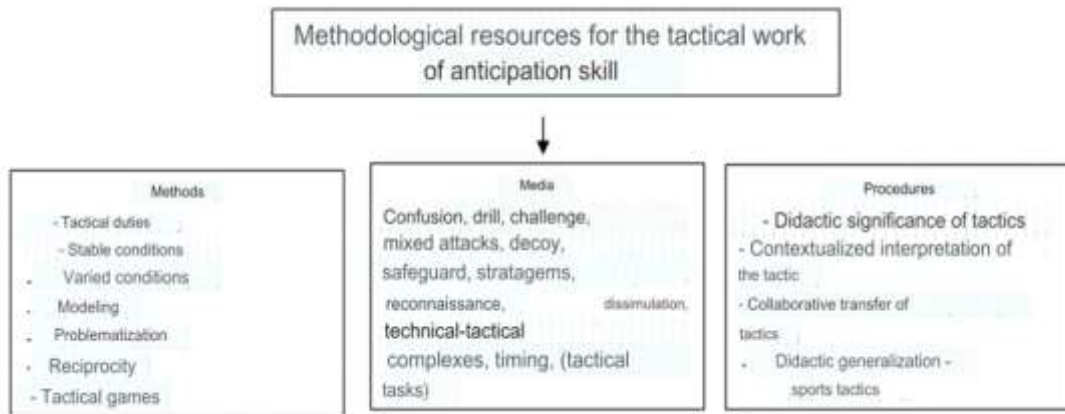
Fig. 2. - Complexity of tactical tasks

After implementing the tactical tasks as part of the methodology, with the methodological resources considered by the authors, we proceed to the evaluation of the effectiveness of the tactical action in the solution of changing situations during the confrontations. For which a third unit of analysis was used that includes three dimensions with their respective indicators, where the pre-experiment takes place when comparing the results of the youth wrestlers before and after applying the methodology.