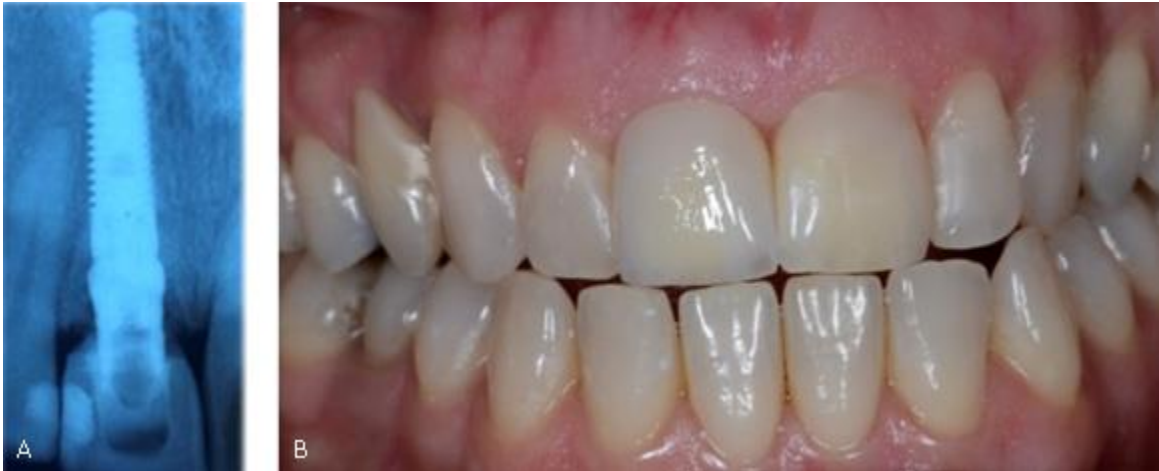
Fig. 3 - Six month after implant placement. A- Radiographic control. B- implant-supported single fixed prosthesis

After several stages, the final restoration with a zirconium dioxide abutment and a full ceramic crown was obtained and cemented (Fig.3B).