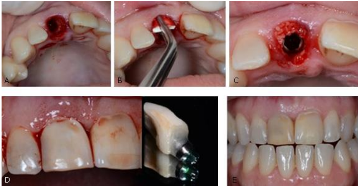
Fig. 2 - First surgical phase. A- Tooth 1.1 extraction. B- Resorbable collagen membrane. C- Particulate allograft cortical Puros (1cc) to fill the space between the collagen membrane and the dental implant. D (1-2)- Temporary restoration with natural tooth 1.1. E- Temporary restoration follow up after 4 months from implant placement.

E). The emergency profile was established by simply adding composite (flowable), until the desired contours were achieved.