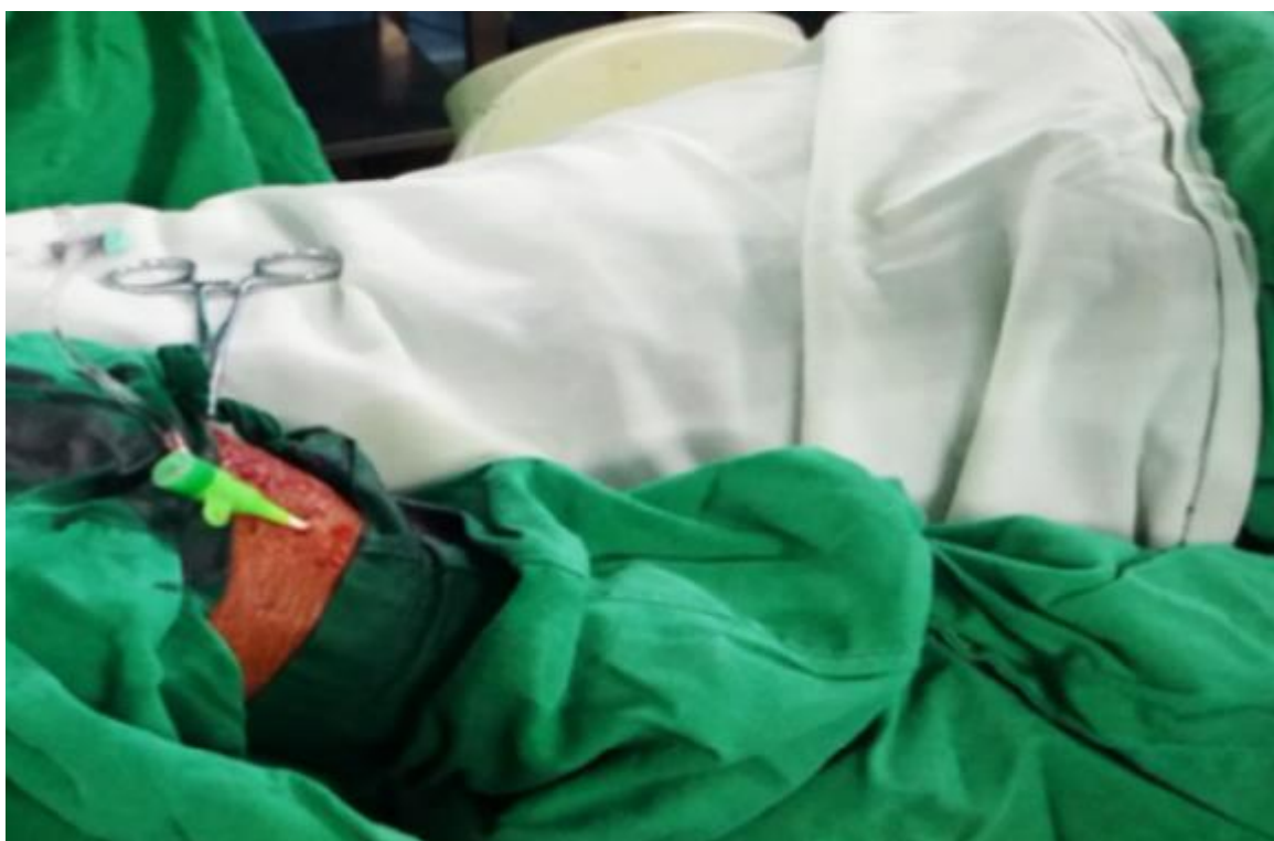
Fig. 2 - Radial introducer 6 Fr (Terumo) in left distal radial artery. Laboratory of hemodynamics and interventional cardiology of ICCCV.

This is a small sample, but it is the initial experience of a month of work of the ICCCV, where since its inception the TFA has been and is the preferred one. If we keep in mind that the distal left radial access path through the anatomical snuffbox requires training and a learning curve in operators trained in catheterization by the conventional anterior radial pathway. (16) In the figure 2 shows the left distal TRA performed in our catheterization laboratory. Then we will understand the value of the first series until the moment published in Cuba.