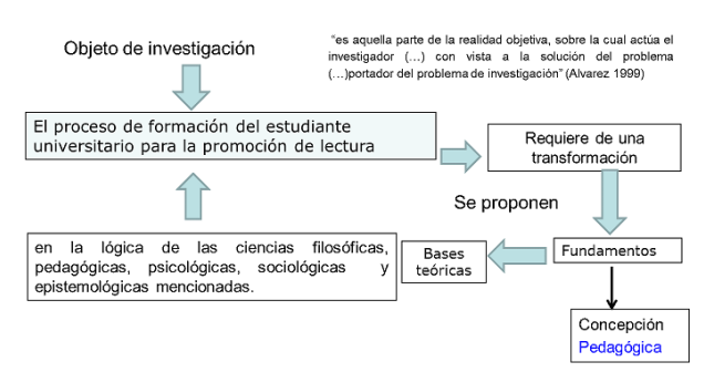
Fig. 1- Logic for the foundation of the ideas of the proposed Pedagogical Conception

Enjoyment implies promoting the enjoyment of reading from the transformation of oneself and of others for the enrichment of the cultural heritage.