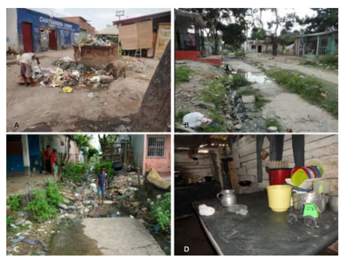
Fig. 2 - Environmental conditions of the Caño de Soledad Sector: a) commercial area, inadequate disposal of solid waste and direct contact of people and animals with these materials; b) - c) residential area, sewage and solid waste streams are observed; d) Interior of one of the houses where rodent capture was carried out.