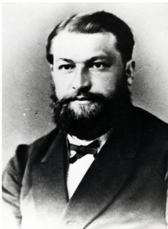
Fig. 1. C. Winkler (1838-1904) ("Clemens Winkler als", 1875).

On October 11th, Winkler was solemnly buried to eternal rest in the Trinitatisfriedhofe zu Dresden [Trinity Cemetery in Dresden] amid moving manifestations of mourning on the part of all those who had learned to love and respect him. The great scholar, the loyal advisor and friend of the miners and huts, has "done his last shift". Now the eternal light of truth shines for him, which he had so eagerly investigated in life (p.12).