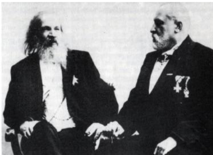
Fig. 3. Dmitri Ivanovich Mendeleev and Clemens Winkler (left, and right respectively) (“Clemens Winkler zusammen”, 1900)

A Monument in honor of Winkler was erected in Freiberg, the town where he was born (“Clemens-Winkler-Denkmal”, 2013). In addition, an image of a commemorative plaque made in his honor can also be found in the literature. It was funded by the Gesellschaft Deutscher Chemiker (Society of German Chemists) and unveiled at the Old Chemical Institute of the Technischen Universität Bergakademie (Technical University Bergakademie) in Freiberg, on October 20, 2004, on the occasion of the 100th Anniversary of his death (“Historische Stätte der”, 2021). It has the following inscription: