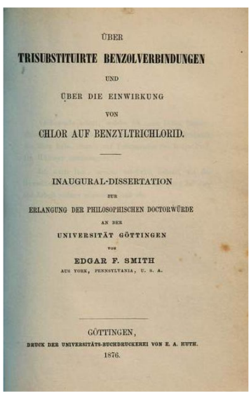
Fig. 2. Title page of E. F. Smith's doctoral dissertation (Göttingen: Druck Der Universität-

On 1876, he defended his doctoral dissertation entitled Über Trisubstituirte Benzolverbindungen und über die Einwirkung von Chlor auf Benzyltrichlorid (About Trisubstituted Benzene Compounds and About the Action of Chlorine on Benzyl Trichloride) and received his Ph.D. Figure 2 shows the title page of his dissertation (Smith, 1876).