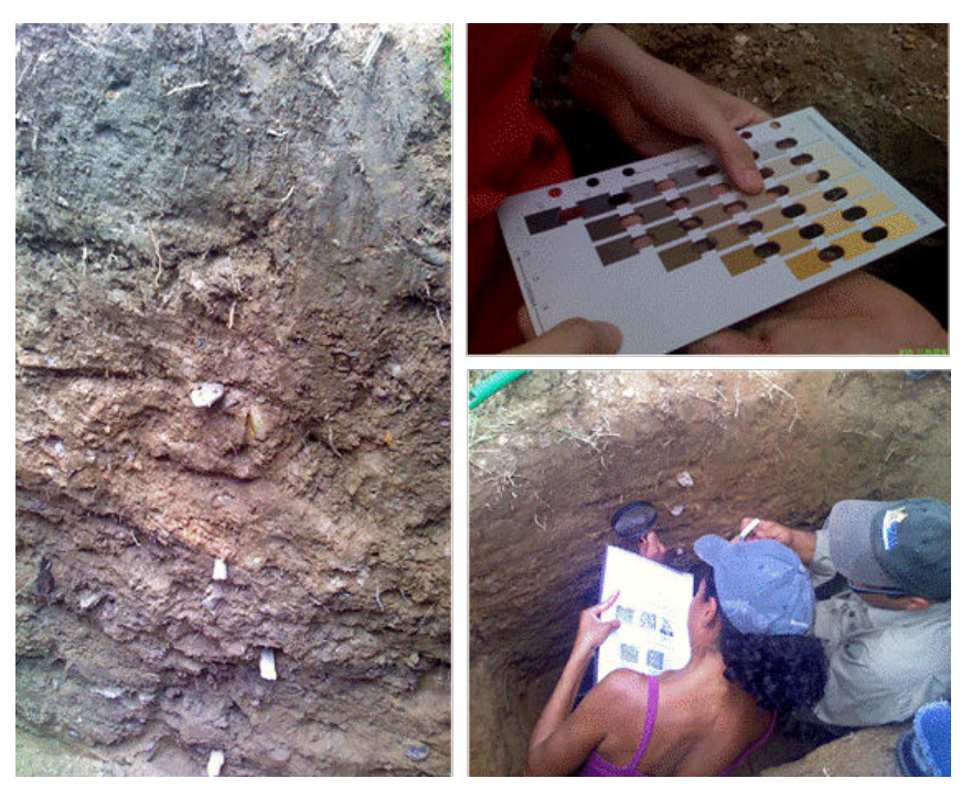
FIGURE 5. Soil profile of "Las Cadenas" Community, Miranda State.