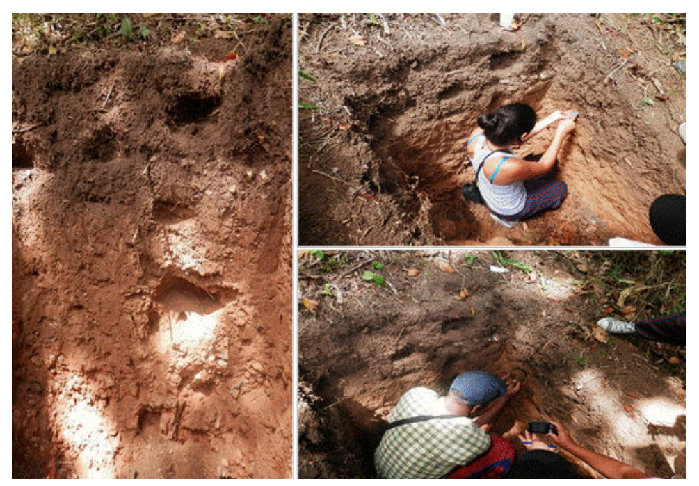
FIGURE 4. Soil profile of the "Daktari" Farm, El Hatillo, Miranda State.