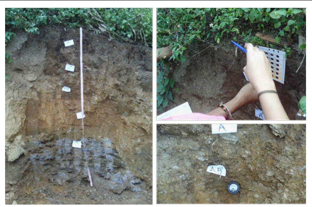
FIGURE 3. Characterization of soil profile in "El Porvenir" Community, Caracas, Capital District.