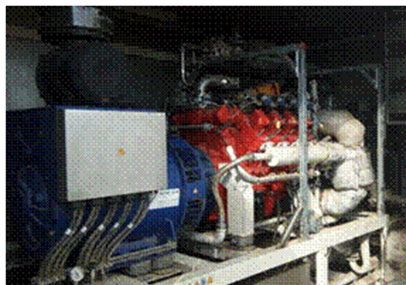
FIGURE 7. Detail of the internal combustion motors which transform the biogas into electricity.

The technology for the biogas production with solid substrates is broadly well-known and in constant development in Germany and Europe. The whole technological package meets norm with national and international norms of obligatory execution. In these moments, Germany is trying to export this technology to the developing countries. Some African countries are already interested in the topic. Cuba could be in the sphere of influence of these technologies with regard to Center and South America. It would not be anything disheveled to try to prove a station of this type of small format with the purpose of to win knowledge and to value their possible technician-economic viability. In all new projects, it will always be necessary to run risks. An important aspect will be to define the foreign partners and its interests in the holding in projects of this type in Cuba.