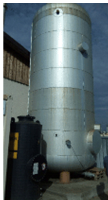
FIGURE 6. External of the plant, where the tank is appreciated to store the surplus of the generated hot water.

small format in Cuba. For that a foreign investor is needed. Since the advantage of this plant type could be the non-association to any swinish or cow facility. Clear this, when depending totally on solid substrates; one would have to guarantee the whole infrastructure to produce them and to prepare them for the process of biodigestion of solid substrates. Of achieving the above-mentioned, it would be the knowledge of if it is possible or not, this technology type in the Cuban case. Finally, the great one questions to it will be: That the foreign investor obtains if he decides to carry out a project of this type in Cuba? To our approach: