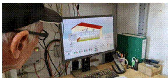
FIGURE 9. Detail of the program to control the operation of the biogas plant. Observe the showers for spread the inoculum and the pipes to capture the biogas.