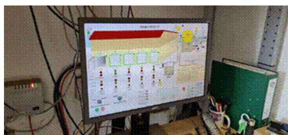
FIGURE 10. Detail of the pursuit of the process in each digester by means of the room control.