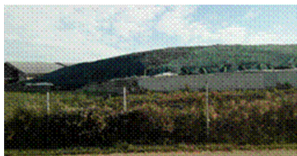
FIGURE 3. Bunker silo for fermentation of the corn (silage) for their later bio fermentation. Observe the roof of the installation covered with photovoltaic panels.