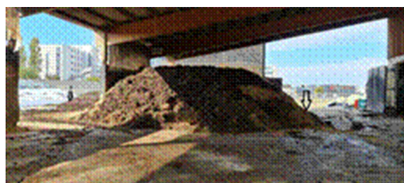
FIGURE 4. Particulars of substrates without digesting (a) and digested (b) evacuated of the digester 1. The door digester 1 are observed open for extraction of digested material and their later one filled.