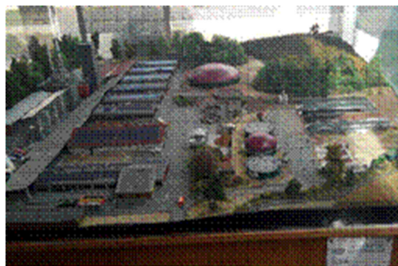
FIGURE 1. Small scale of a biogas plant associated to bovine facilities: I file of the author.

In agreement Cuba with Suárez et al. (2021) a potential of production of upward biogas exists to 136 533 211 annual m 3 , with an energy value of 75 289 tep/years and a potential of generation of electricity of 245 760 MWh/years. The biodigesters that are used in Cuba doesn't generally overcome the 90 m 3 of capacity. The main diffused technologies are those of fixed dome or Chinese model and the tubular plastics. Another technology that it has begun to introduce is the biodigesters of covered lagoon, appropriate for big masses of animal and for the electricity generation. Although they require a bigger initial investment, they have smaller investment cost for cubic meter of digestion capacity. These biodigesters that overcome the thousands of cubic meters, requires synthetic geo-membranes, electricity generators and other teams and cared auxiliary components. In an evaluation carried out by the Ministry of the Agriculture (MINAG) in the year 2020 that it embraced swinish 138 center, 4 198 swinish agreements, 1 999 dairies and 290 poultry farms, is a potential of electric generation of 807 552 MWh/years appreciated, equivalent to 241 782 t/years of fuel that avoids to emit 3,6 MM t of CO 2 eq/years. This potential allows producing