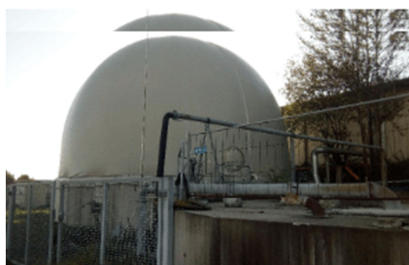
FIGURE 8. Detail of the tank to store the biogas produced.