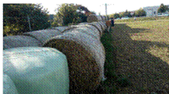
FIGURE 2. Detail of the fresh substrates dedicated to the fermentation (packed). It observes that in some cases they are covered with nylon.