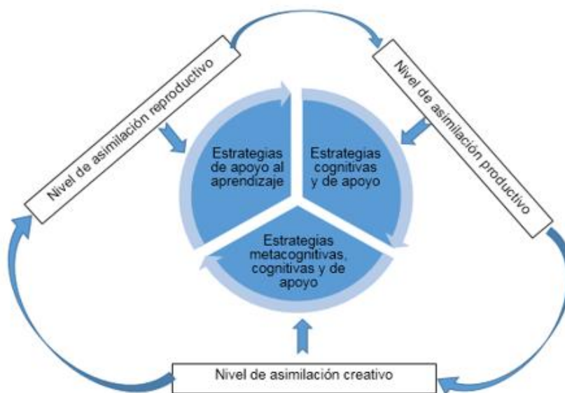
Fig. 1. - Dimensions and most representative indicators of the variable

The selection of these instruments was marked by the study variable: Assimilation of statistical techniques in the training of the Physical Culture and Sport professional. For the selection of the study dimensions and indicators, the classifications of learning strategies were adopted (Figure 1).